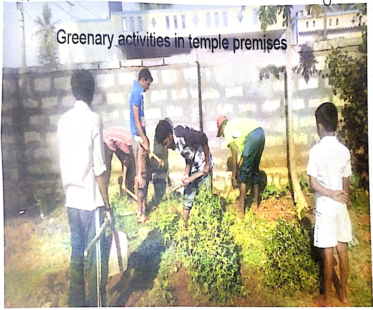
Greenary activities in temple premises