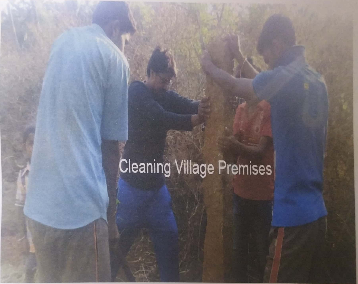
Cleaning Village Premises

Environmental Promotion Activities beyond the Campus